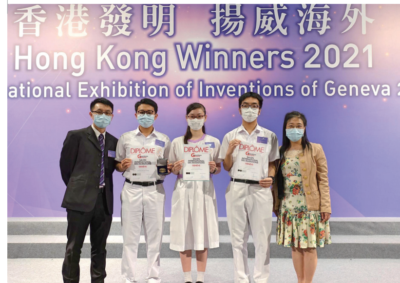
A c a d e m i c A f f a i r s

We promote an English learning environment in the school. English Days, Language Across Curriculum activities, drama tours, English debating competitions, writing competitions and exchange programmes are organised in order that students would gain more exposure to English and greater ability in learning through English.